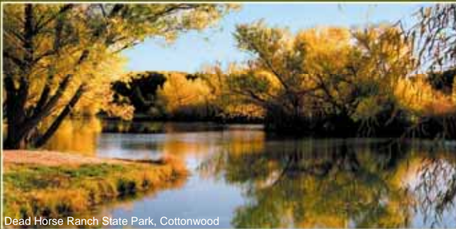
Dead Horse Ranch State Park, Cottonwood