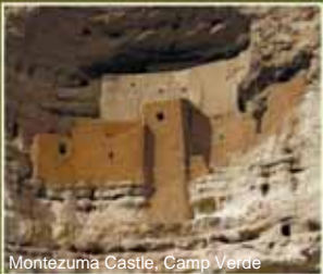
Montezuma Castle, Camp Verde