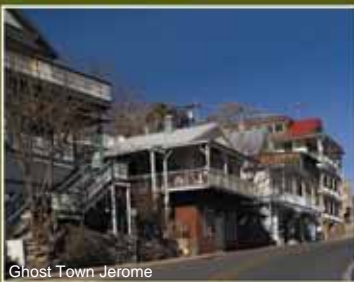
Ghost Town Jerome