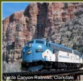
Verde Canyon Railroad, Clarkdale

Visit Camp Verde, Clarkdale, Cottonwood, Jerome, Sedona and the Yavapai-Apache Nation in northern Arizona to find out — it's just 2 hours north of Phoenix!