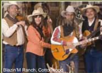
Blazin' M Ranch, Cottonwood